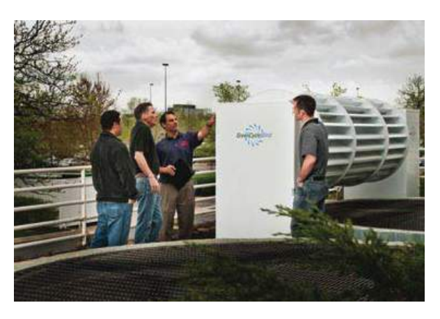
Fig. 5: LORD Corporation's sales and technical support allowed Green Cycle Wind to reduce costs and improve performance and durability for their wind turbine

assisting the company with a complete adhesives solutions program that includes joint design support, application recommendations, adhesive dispensing, parts processing, automation, parts fixturing, and final assembly. At its plant in Schaumburg, Illinois, the company has built an active-demonstration turbine wind unit that explains the waste-energy recovery process and shows measurement of the new energy generated. The demo cell points out the various components included in the wind turbine assembly, including LORD structural adhesives.