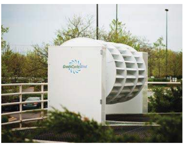
Fig. 3: LORD Corporation's new Maxlok adhesive is utilized in the construction of the dual source Green Cycle Wind turbine to improve joint design, reduce weight and reduce assembly design.

LORD's technical service group helped its client implement the solutions package. "Reducing assembly costs and improving fatigue life were definitely the key drivers in the successful collaboration with Green Cycle Wind's turbine design," says Bob Zweng, global product integrator at LORD. "With our strong adhesive implementation knowhow we were able to offer immediate input, sharing best practices with novel application processes and proven joint fabrication techniques."