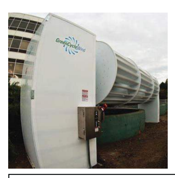
Fig. 4: Green Cycle Wind's turbine made with LORD Maxlok adhesives allows companies to implement green solutions.

Currently, Green Cycle Wind is planning to build a full-scale manufacturing facility to produce wind turbines using structural adhesives. LORD Corporation is