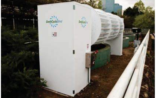
Fig. 1: Green Cycle Wind's turbine utilizes both natural and waste wind sources to reduce energy bill costs for companies.

LORD Corporation has extensive experience in supplying structural adhesives for product as-