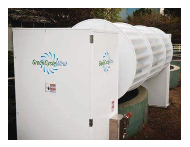
Fig. 2: LORD collaborated with Green Cycle Wind turbine.

to assemble components of their dual source wind next-generation Maxlok acrylic adhesives were the perfect choice to meet Green Cycle Wind's challenging requirements including bonding dissimilar materials, improving durability and fatigue life, reducing weight reduction, and enhancing product aesthetics. We even provided R&D technicians to Green Cycle Wind, whose