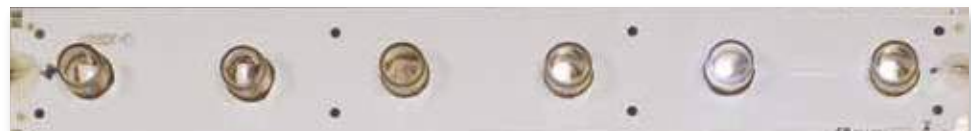
Photo 2: LEDs without Henkel compatible products