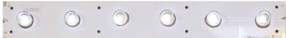
Photo 1: LEDs utilizing Henkel compatible products