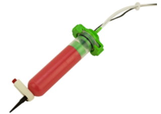
Finger Switch (Optional)