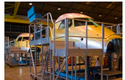
Metal Bond Adhesives