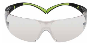
Indoor/Outdoor Mirror Lens